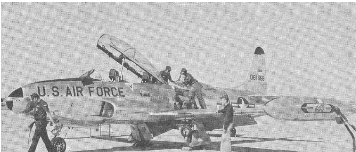
479 th Maintainers servicing a T-33